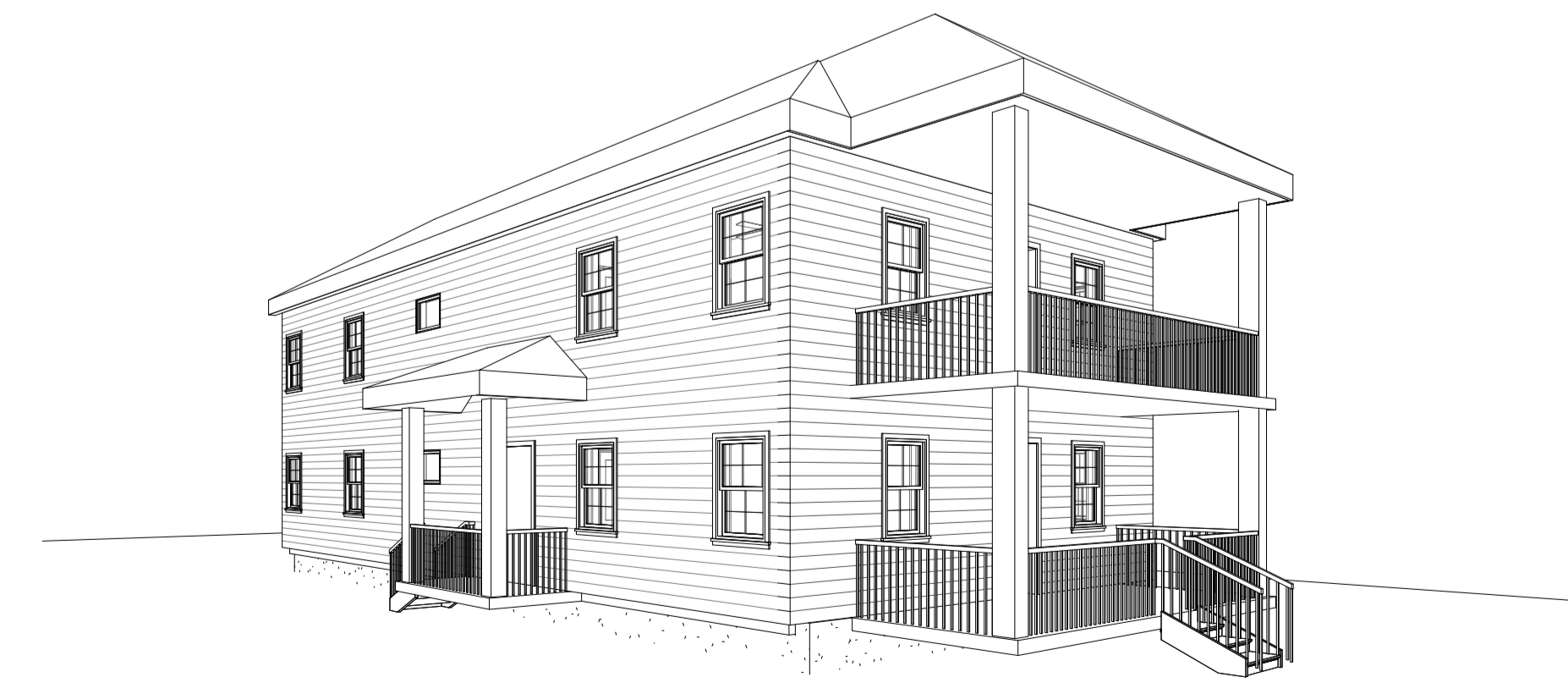
③ SOUTHEAST VIEW