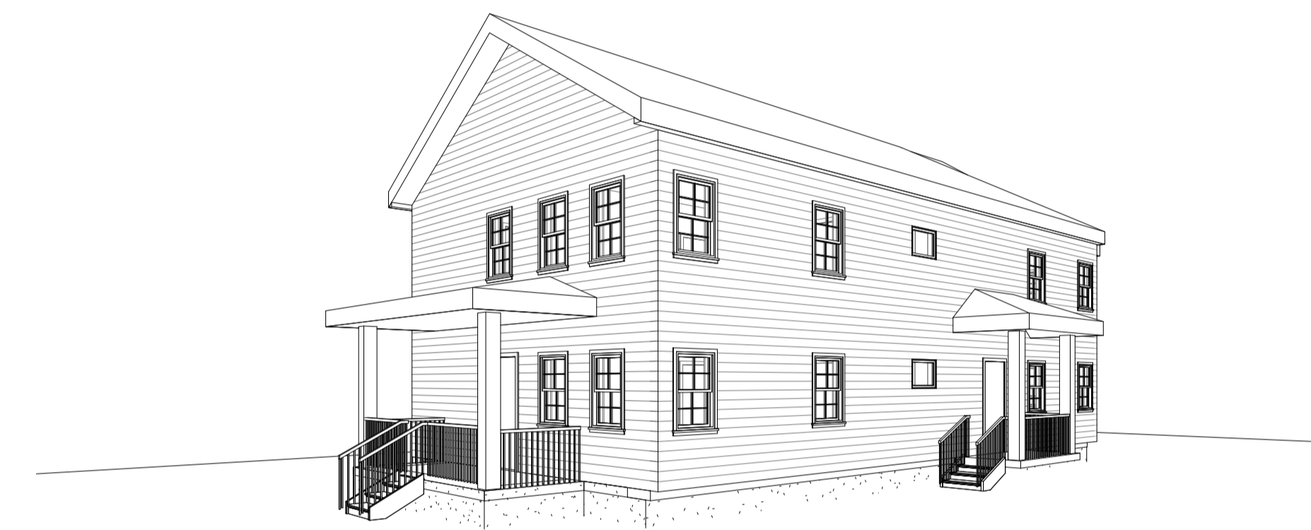
④ SOUTHWEST VIEW

architect: Nuva LLC Lee's Summit, MO 64081 816-914-6109 nuvalc.com